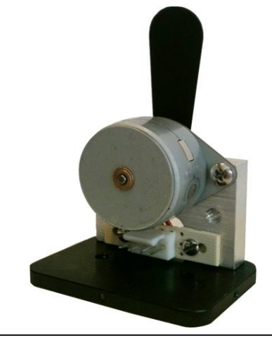
Patents No.: US 6,046,836 US 6,215,575 B1 US 6,466,353 B2